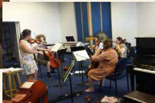
Perth, Australia: More Quintets