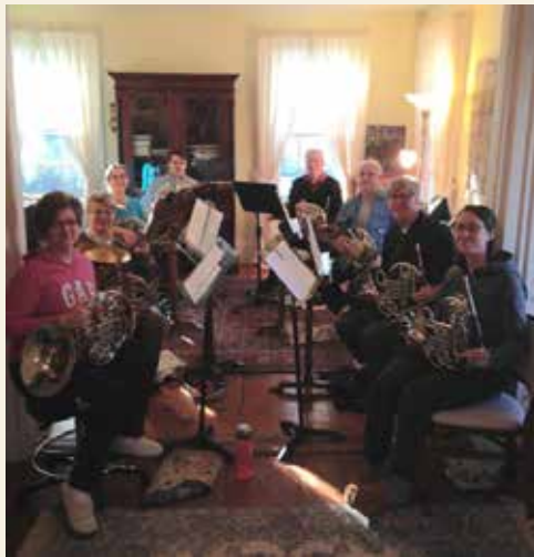
Trumansburg, NY A Horn Octet