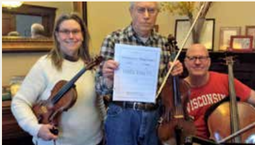
Freeport, NY: A Quartet by Ethel Smythe