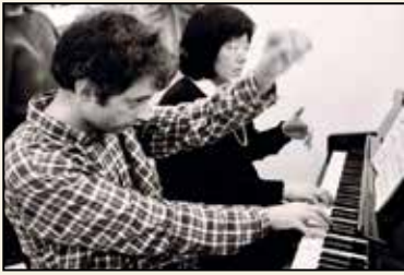
Shanghai, China: Piano 4 Hands