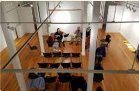
Salem, OR: modern architecture