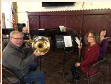
San Diego, CA: Quintets and smiles