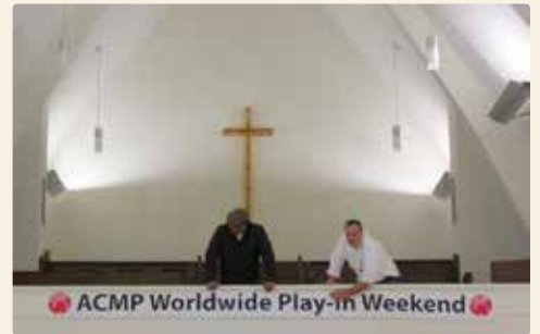
Oakland, CA: a church