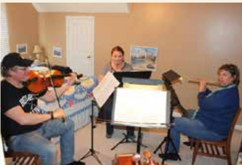
Atlanta, GA: a bedroom