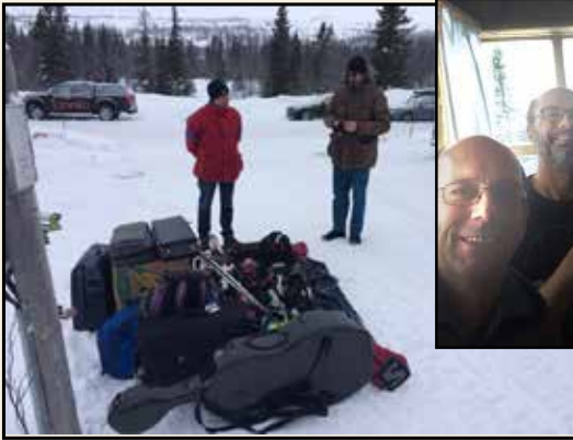
Sweden: Quartets and Ski Treks