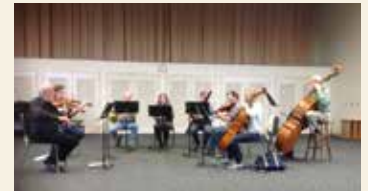
Iowa City, IA: A String, Wind, and Brass Octet