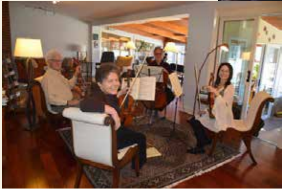
Kingston, Ontario: A String Quartet