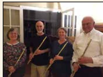
Oakland, CA: Flutes and smiles