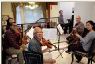
Shanghai, China: A Piano Sextet