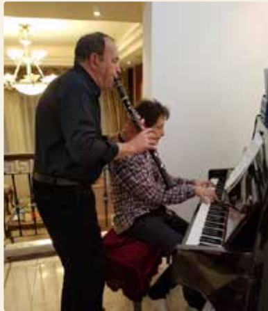
Shanghai, China: Clarinet and Piano duet