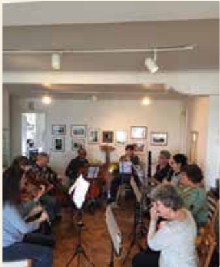
New York, NY: A Wind and String Nonet