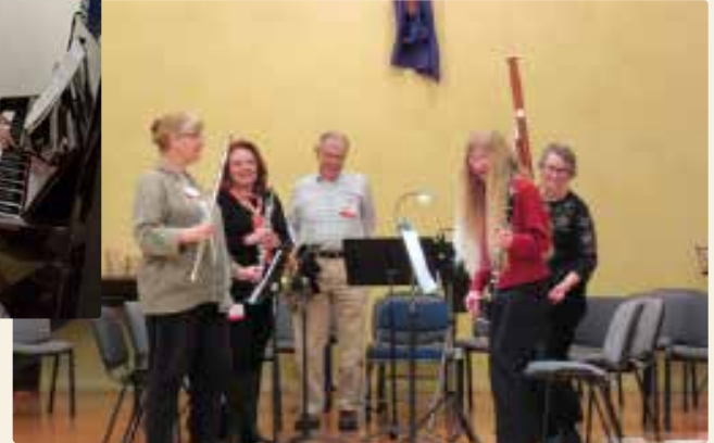
Oakland, CA: A Wind Quintet