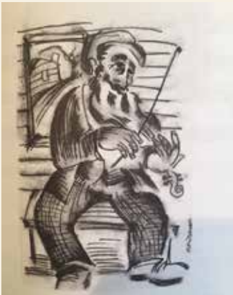
Tolechenaz, Switzerland: Klezme