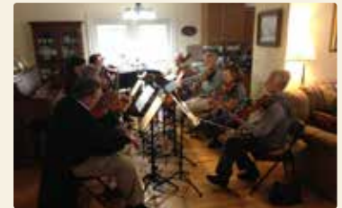
Brevard, NC: A String Octet