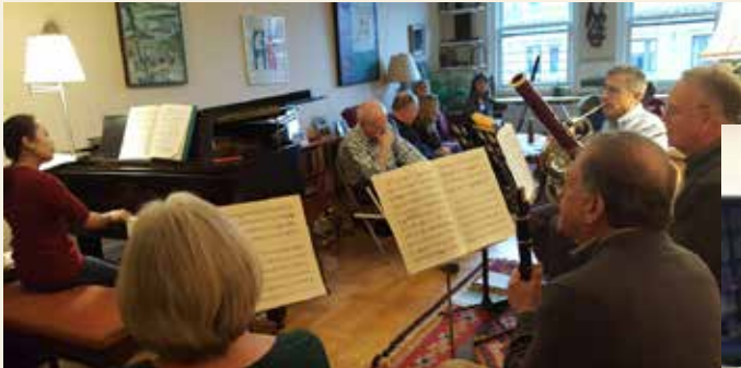
New York, NY: A Piano and Wind Quintet