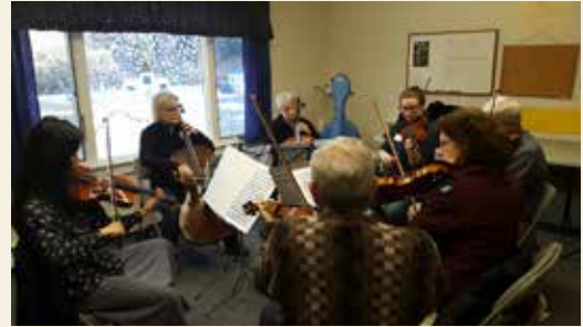
A Snowy Septet