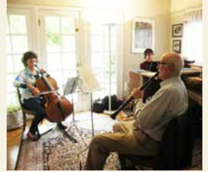
Santa Monica, CA: Trios