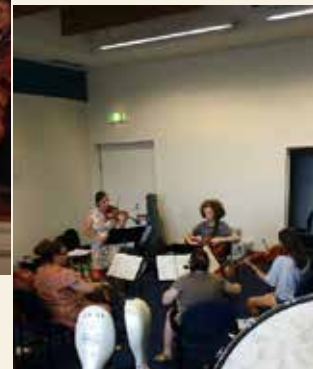
Perth Australia: behind timpani and cello cases