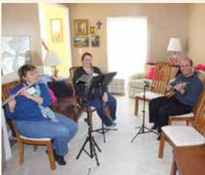
Atlanta, GA: Flute, Clarinet, Mandolin and smiles