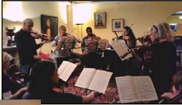
New York, NY: Brandenburgs