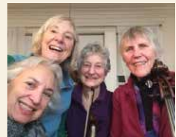
Selfies in Providence, RI