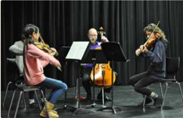
St Paul, MN