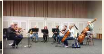
A String, Wind, and Brass Octet