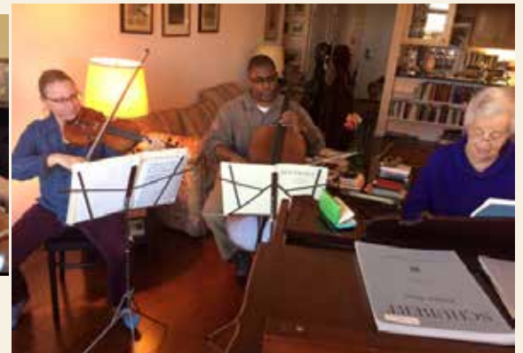
Davis, CA: Beethoven and Schubert