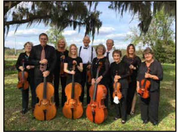
Lecanto, FL: Cellos and Palm Trees