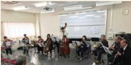
Kawasaki, Japan: A Nonet at the Showa School