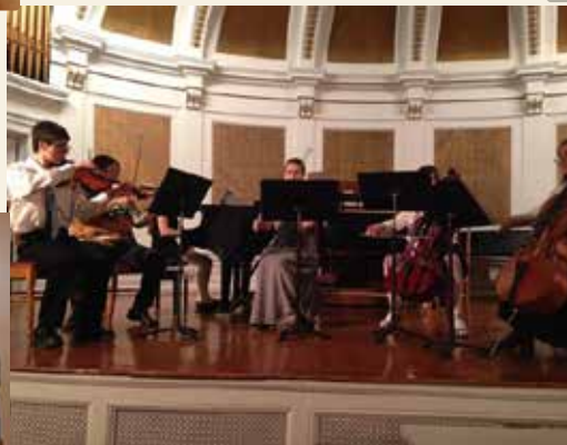
Cumberland Valley, PA: Cumberland Valley School of Music