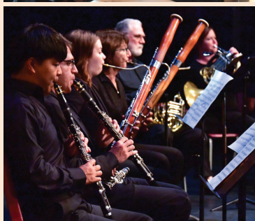
ACMP Foundation grantees